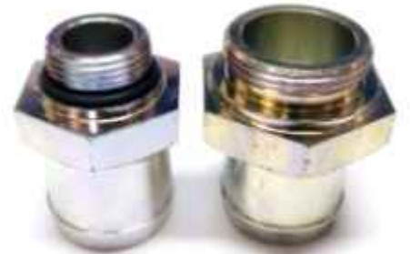
Low Pressure Adaptor