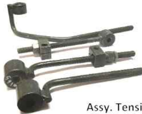
Assy. Tensioner Rod