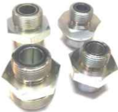
Face Groove Adaptor