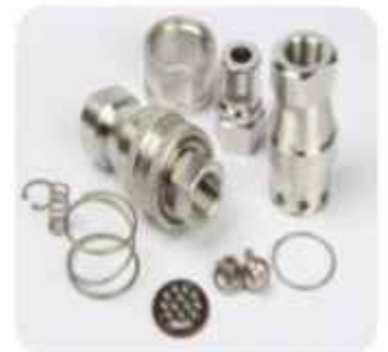
Quick Release Valve