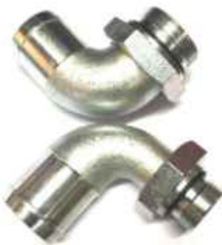
Low Pressure Elbows