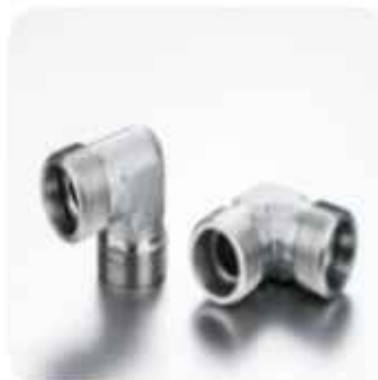
Elbow - Both End Male