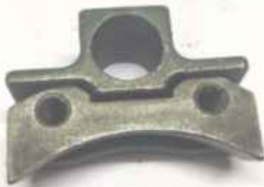
Sensor Mounting Brackets