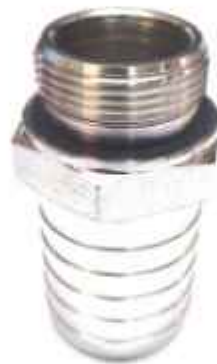
Hose Nipple Adaptor