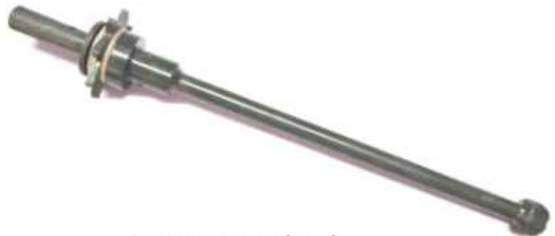
Assy spare wheel with handle shaft