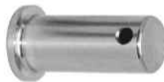
Cylinder Mounting Pins