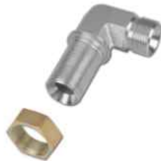
Bulk Head Elbow