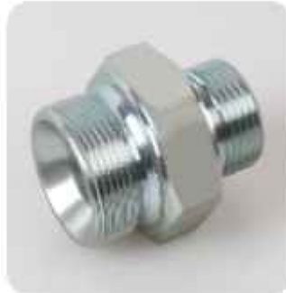
60° HUDRAULIC FITTING ADAPTORS