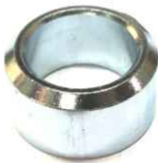
Bush For Cylinder Mounting