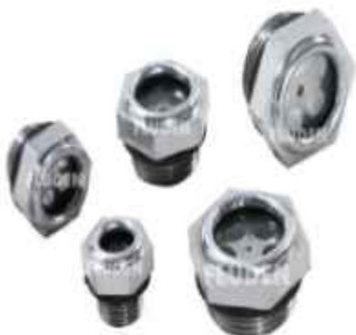
Oil Level Indicators