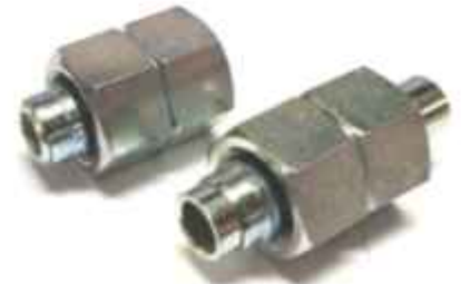
Seamless Tube Assembly