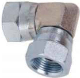
Both Side Swivel Elbow