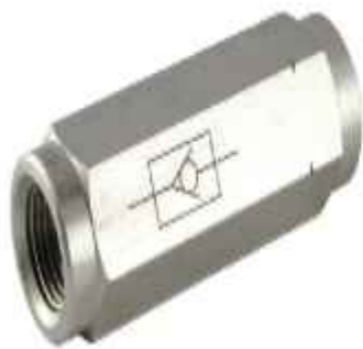
Non Return Valves