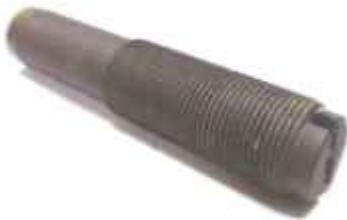
ADJUSTING PIN FOR AXLE APPLICATION