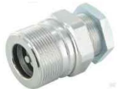
Quick Release Valve

Company Address – 98A/3, Hadpasar Industrial Estate, Behind Kirloskar Pneumatic, Next to Railway Line, Pune-411013, Maharashtra, India.