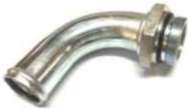
Bend Pipe Elbow