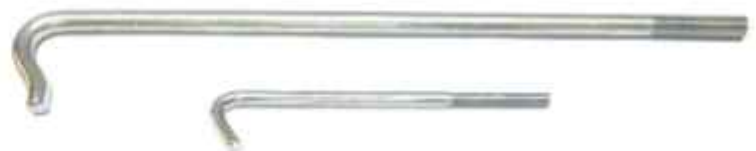
Battery Bent stud

Company Address – 98A/3, Hadpasar Industrial Estate, Behind Kirloskar Pneumatic, Next to Railway Line, Pune-411013, Maharashtra, India.