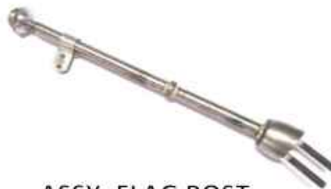
ASSY. FLAG POST