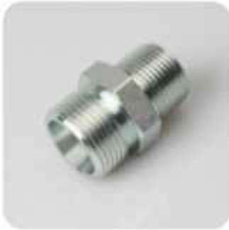
24° HUDRAULIC FITTING ADAPTORS